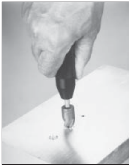
Able to take a variety of 1/4" shank standard and special tools.

The Severance Speed Handle™ is designed for fast efficient part deburring. A wide range of standard Severance 1/4" deburring and chamfering tools can be quickly interchanged for performing and finishing a variety of hand deburring operations.