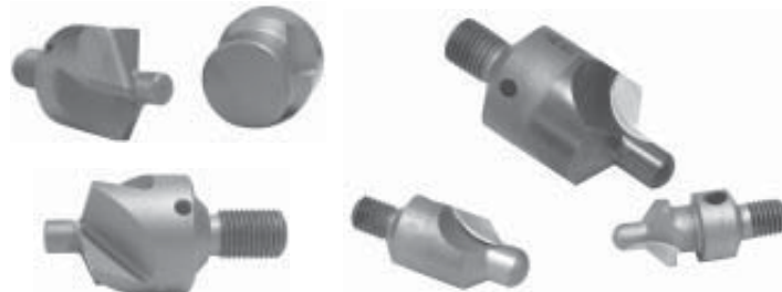
REF. # 55370